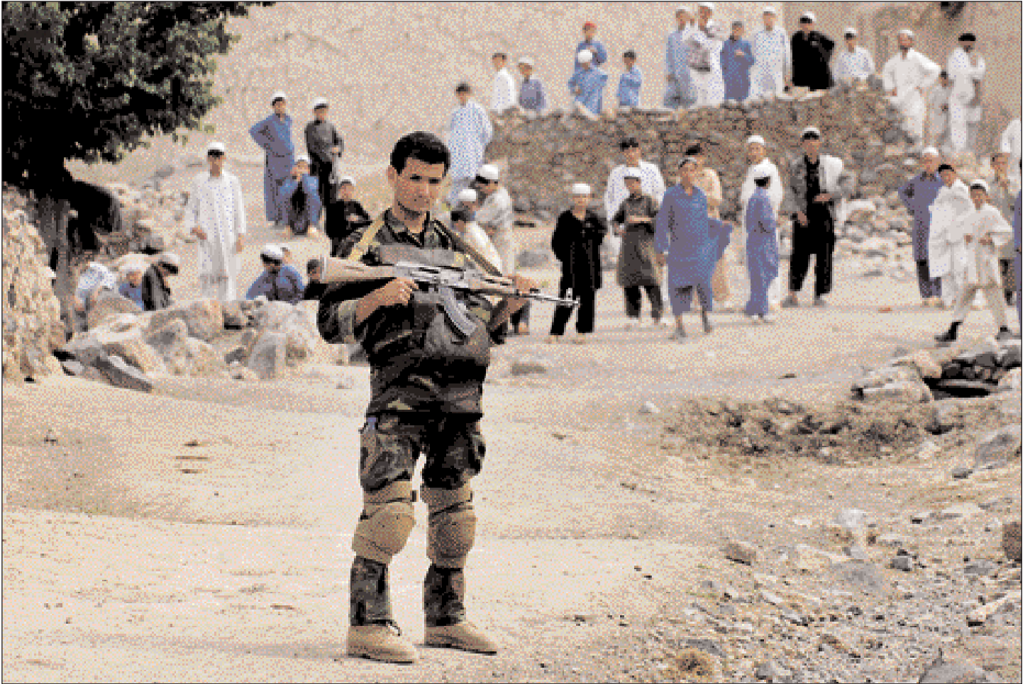
An Afghanistan officer stands guard on a patrol with the Army's 101st Airborne Divisions, Golf Company 4/320th Field Artillery Regiment's in Legharah, a village in the Khost Province.

"The insurgents are like a big school-yard bully ... trying to beat up on the little kid ... we're the big guy who is going to stand behind that small guy, so he feels strong enough to stand up to that bully.