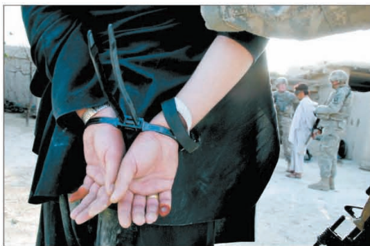
An Afghan man is taken into custody by a U.S. soldier during a raid by the Afghanistan National Police and the Army's 101st Airborne Division's Delta Company 2/506th Infantry Regiment in Dakhi Village in the Nadar Shah Kot District of the Khost Province. The coalition forces arrested three men after finding bomb-making supplies.